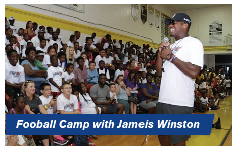
Football Camp with Jameis Winston